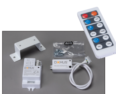
Internal ON/Off Sensor